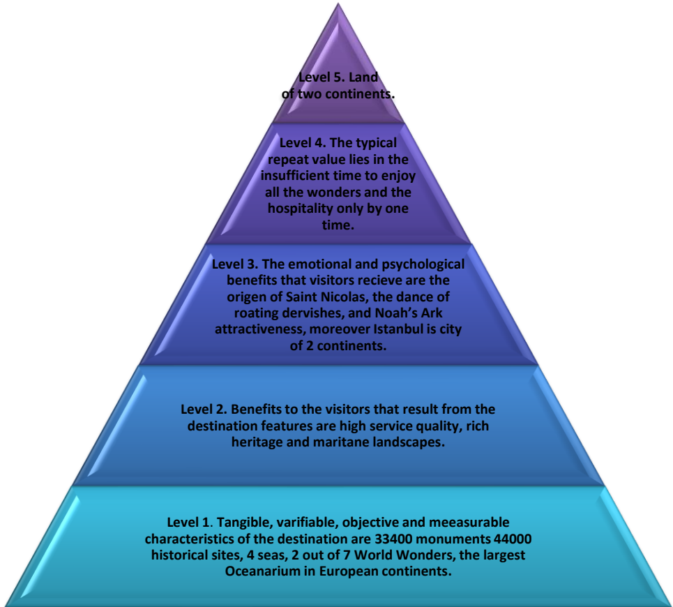
Fig. 2. Brand Pyramid